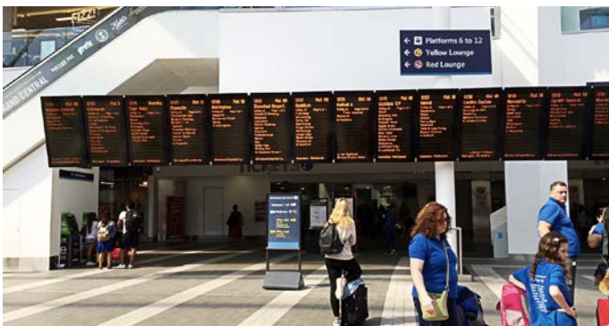
Train departures to Birmingham Airport are not shown on the departures board.

Of particular note was the absolute lack of wayfinding to Birmingham Airport or the difficulty of interchange between Birmingham city centre stations.