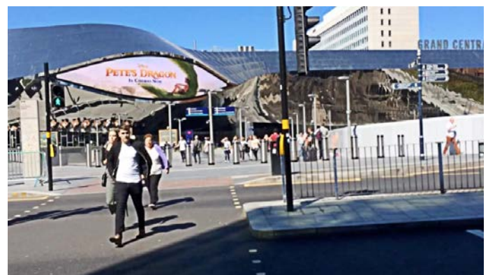
Interchange signage appears to finish here at the entrance to a shopping arcade. A visitor would not know that there is a station underneath.