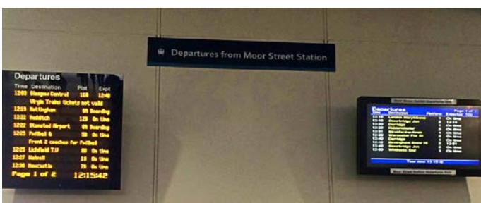
Only one of these screens show departures for Moor Street Station.