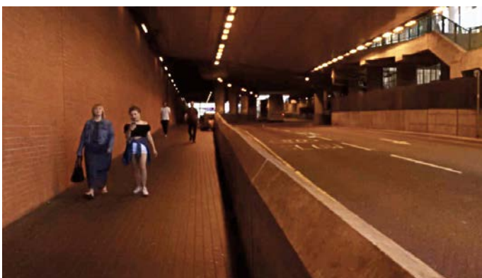
The signposted interchange route through Birmingham city centre leads through this environment.